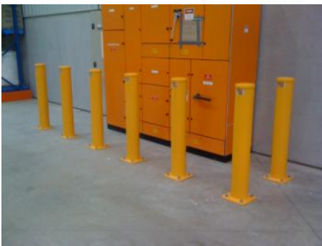
LB165Y—165mm dia bollards protecting the switchboard at Manassen Foods in Sydney

Want to know more contact us now at info@tru-bilt.co.nz