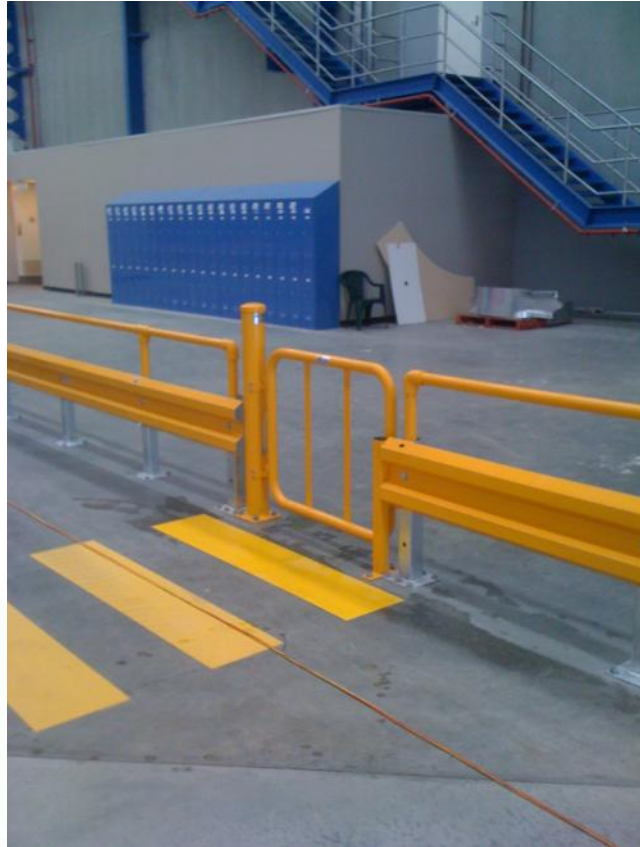
TRU-GARD™ Barrier, hand rail and personnel gates being installed at Manassen Foods in Sydney.