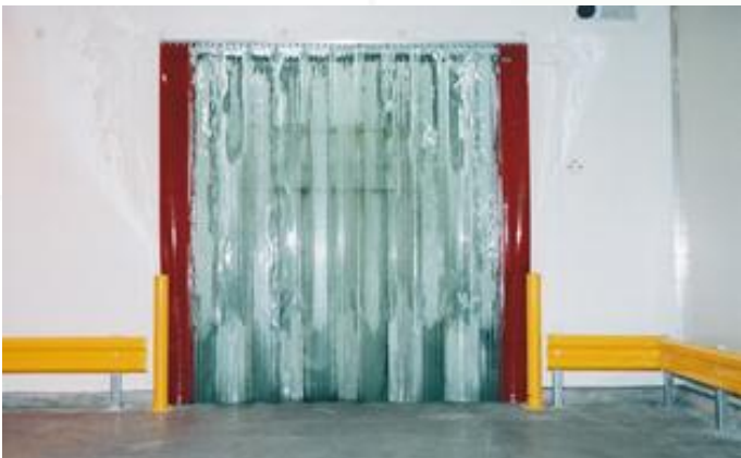
A typical strip curtain with marker strips and additional protection using our TRU-GARD™ barrier and bollards

The tracks are made using TBi's unique aluminium extrusion with cover plates to assist with easy cleaning. This coupled with stainless steel fixings ensures the TRU-STRIP™ meets the strictest requirements of the food industry.