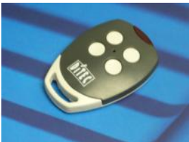
Ditec 4 channel remote

At 115mm wide the Ditec motors used for the TRU-DRIVE™ systems are the narrowest on the market making them perfect for those tricky installations. They come in a pre-wired standard kit with a hold to run switch, a pre-wired logic kit with remote and custom built 3 phase variable speed drives with advanced logic. All models are jack shaft mounted and have an emergency override function.